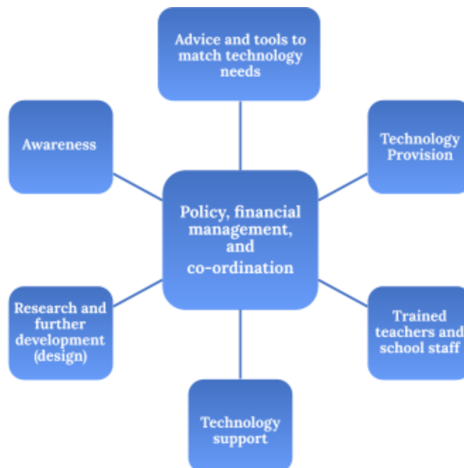
Figure 9: The Technology Implementation Ecosystem

As has been intimated above, although the “Matrix Model” is evidence-based and can assist in generating options for rendering all education more inclusive through the power of technology, implementing a technology selection plan based on the “Matrix Model” is likely to be complicated. In part, this is because the challenges listed above would all need to be addressed for this integration to succeed. Integrating any technology into any learning environment requires addressing a broad range of factors that are often conceptualized as making up a single “technology implementation ecosystem.” These factors include elements explored in section C6 such as: teacher and staff capacity, availability of advice and tools to match technology to needs, technology supports, and continued research and development. A full diagram of the typical ‘technology implementation ecosystem’ is included below.